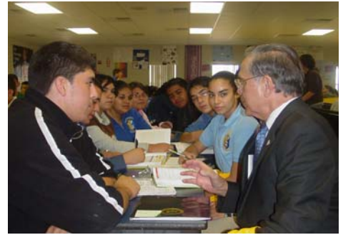
From L to R: Congressman Hinojosa with Santa Rosa H.S. Cheerleaders on Homecoming Night, Congressman Hinojosa at Ruben Hinojosa Elementary in Mercedes on Halloween, Congressman Hinojosa with IDEA Academy Students